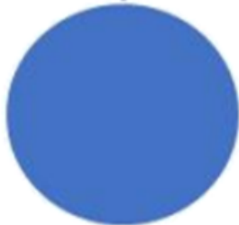
VACANT Youth Support Worker